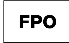
25' Quick-Connect Lighting Extension Cable (#98998)